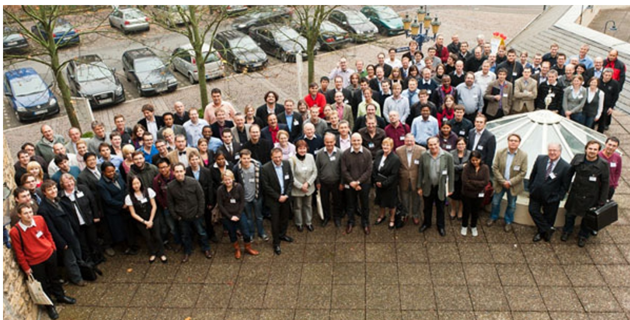
Figure 2 Participants of the 7 th German Conference on Chemoinformatics (GCC2011), November 6 – 8, 2011 in Goslar, Germany.