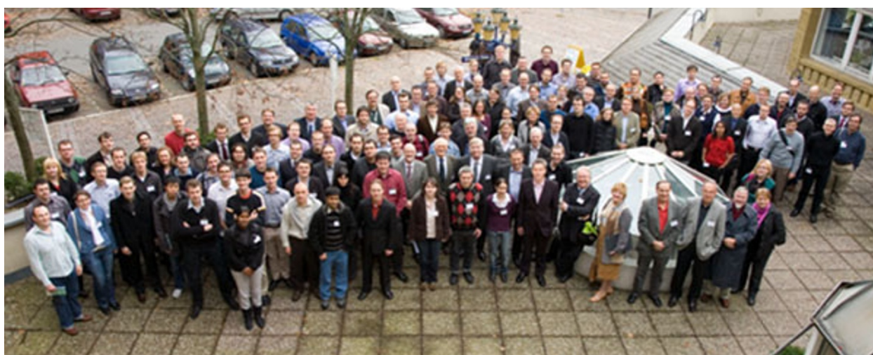
Figure 1 Participants of the 6. German Conference on Chemoinformatics, November 7–9, 2010, Goslar, Germany.